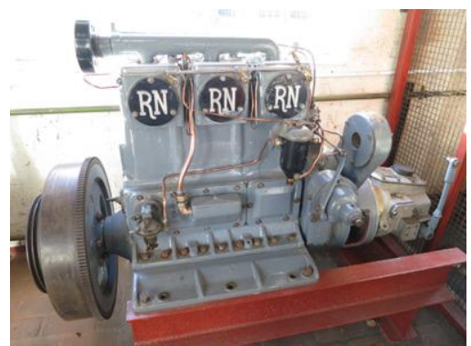
Engine example at the Boat Museum at Ellesmere Port. -----

Did Sherlock Holmes really exist? Check in the latest Newsletter from The National Archives